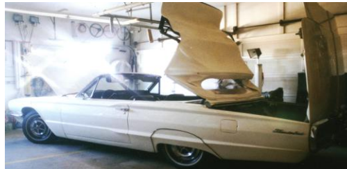
57 Dodge Stainless