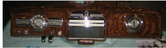
1947 Pontiac Sedan Delivery